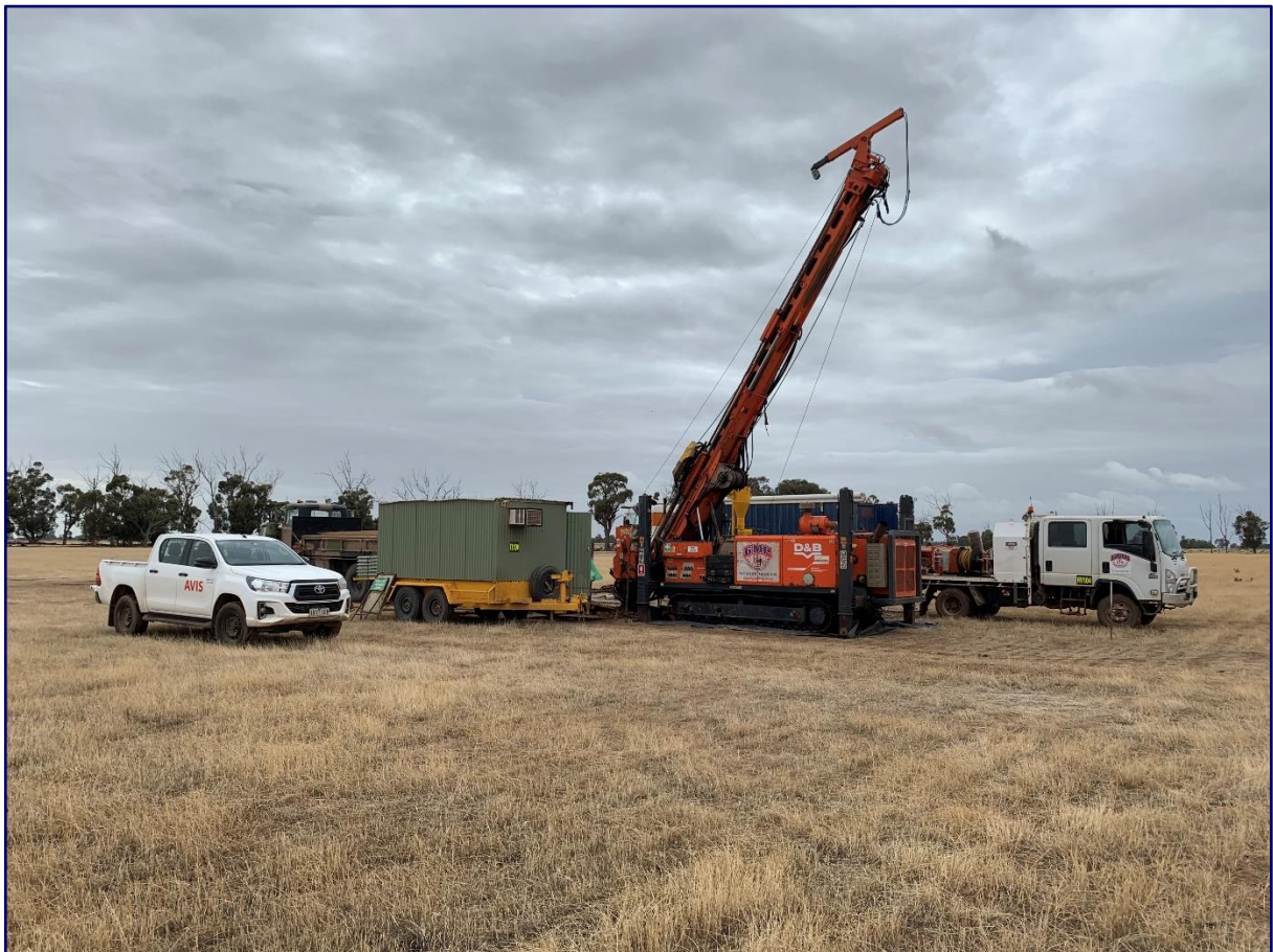
Figure 5 Falcon drilling set up (Diamond – GMP Drilling)