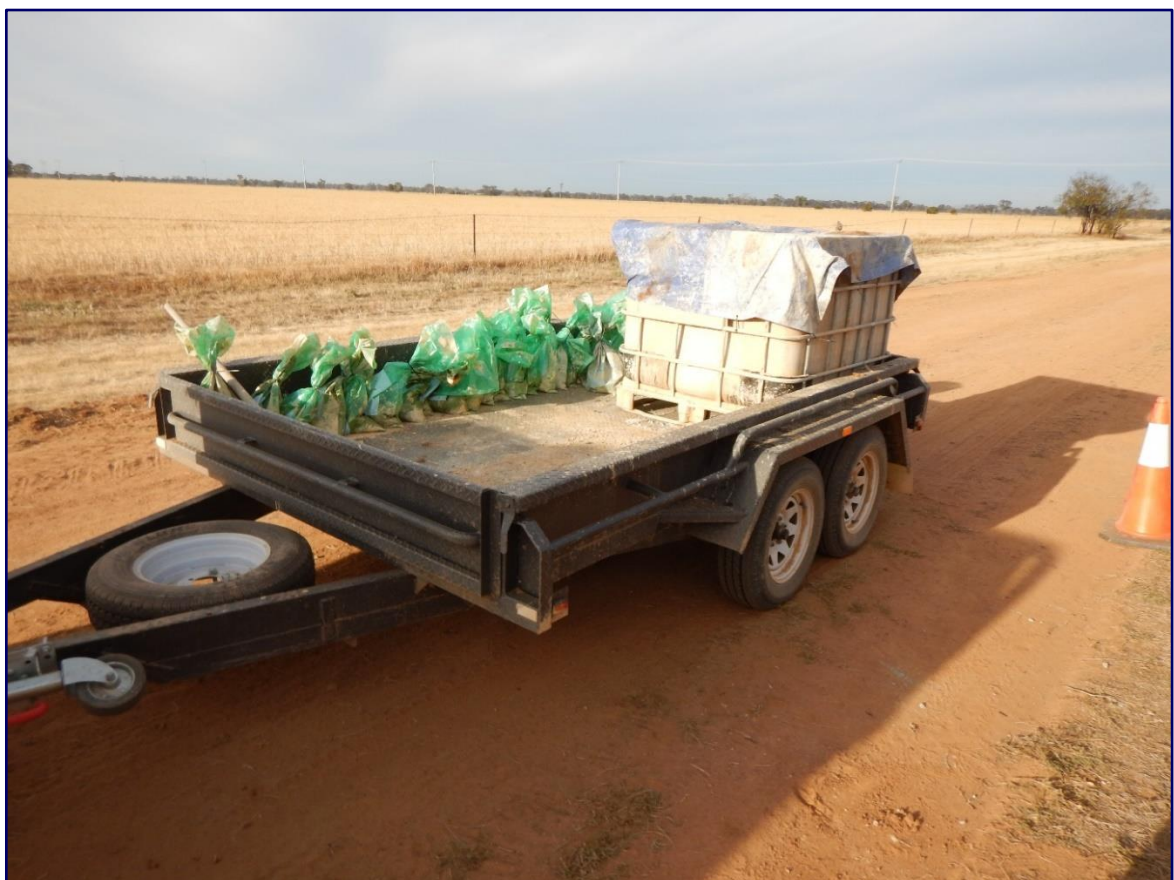
Figure 4 Removal of collected water and waste material