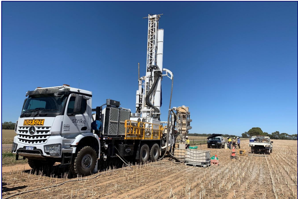
Figure 3 Falcon drilling set up (Aircore - Strike)