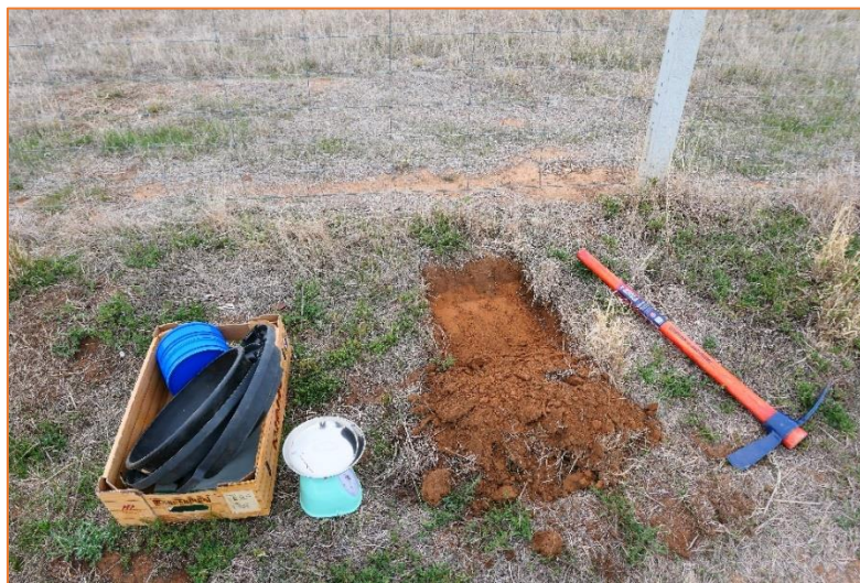
Figure 3 Soil sampling in roadside reserves. The sample hole is backfilled at the completion of sampling.

Falcon has undertaken this technique across large areas of the tenement holdings to determine if anomalous gold is present near surface which may be an indication of gold mineralisation at depth. The technique has minimal disturbance to both the environment and to local residents (see Figure 3).