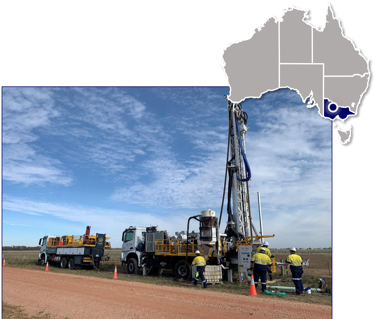
Figure 1 Falcon Metals - drilling activity in progress at the Pyramid Hill Gold Project